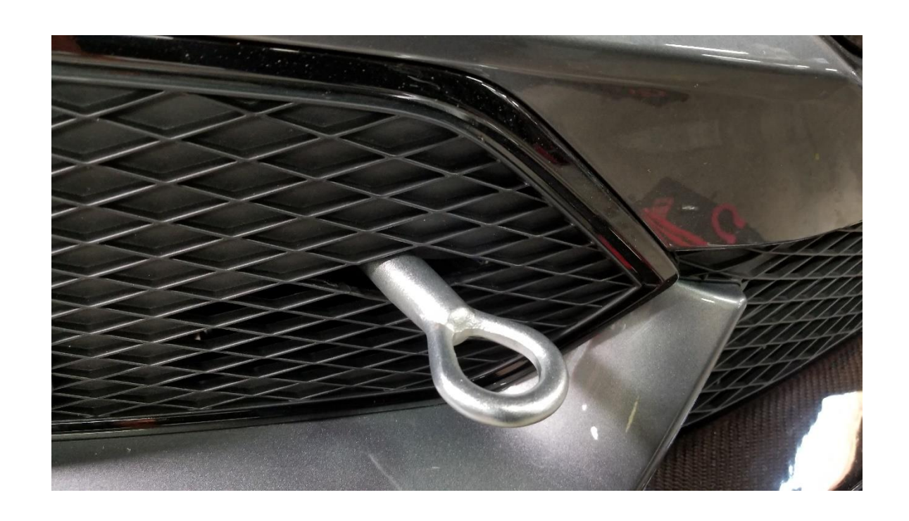
Thank you for your order! Tag us on Instagram! @EVSTuning | #evstuning